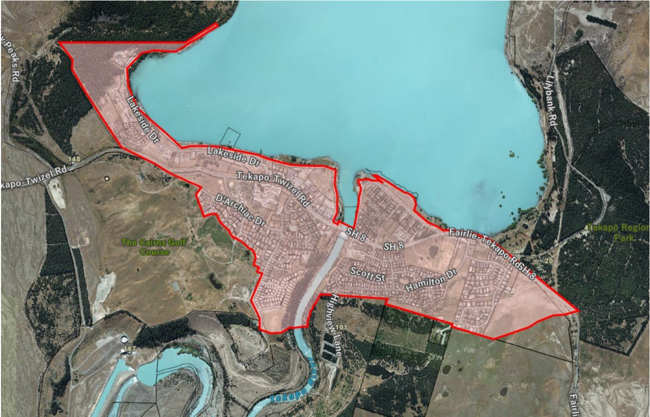
Figure 1 - Takapō /Lake Tekapo Township Prohibited Area