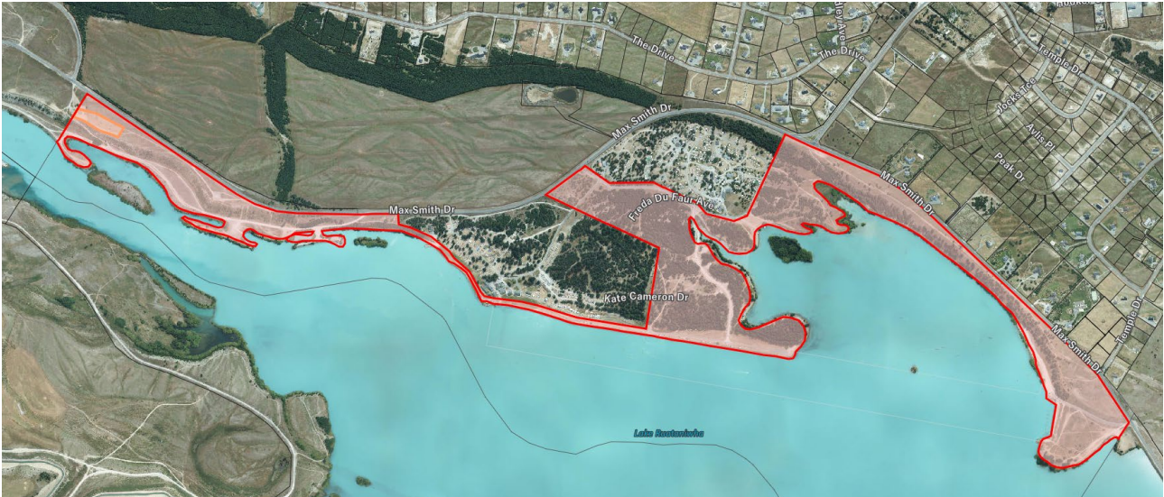
Figure B - Lake Ruataniwha Reserve (West End) Restricted Area