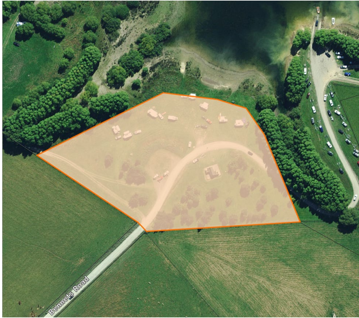
Figure 4 - Lake Opuha - Bennetts Road Restricted Area