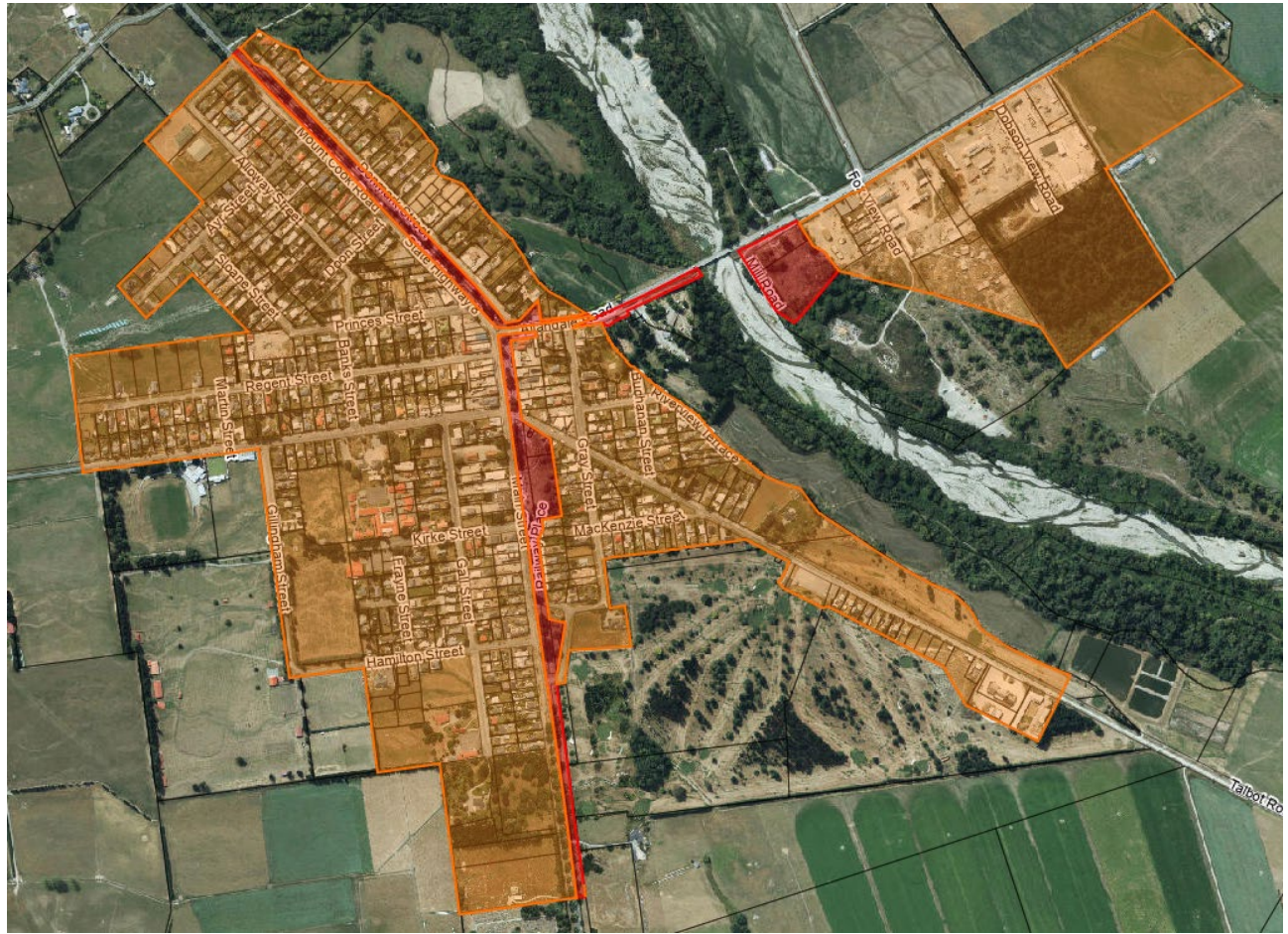
Figure 2 – Fairlie Prohibited and Restricted Areas