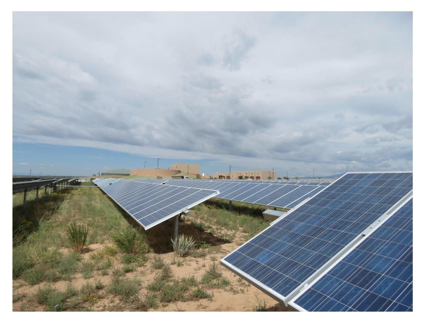
Figure 3. Single axis tracker in 1P format.