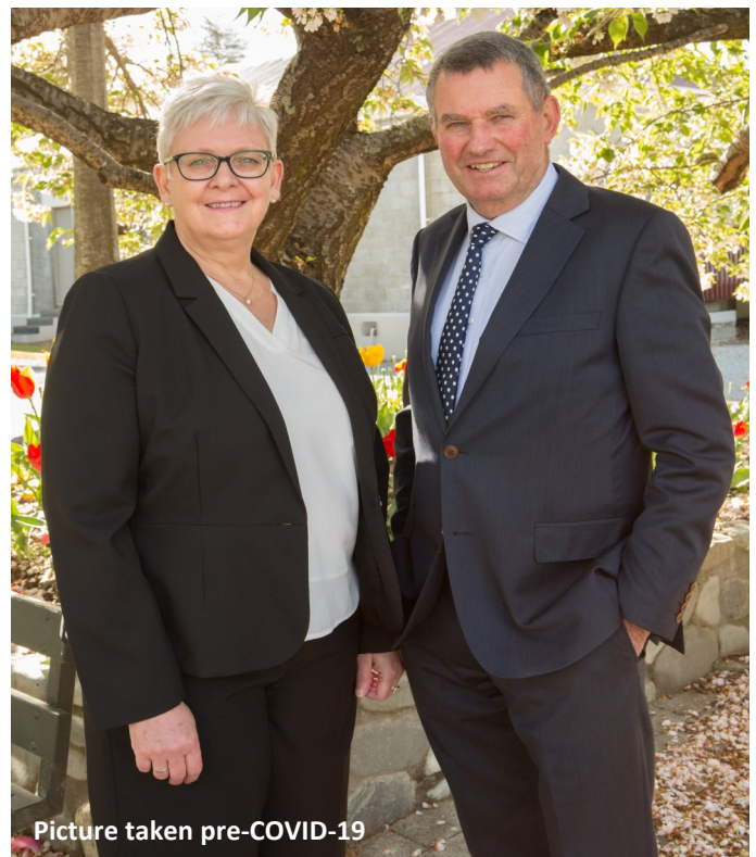
Picture taken pre-COVID-19