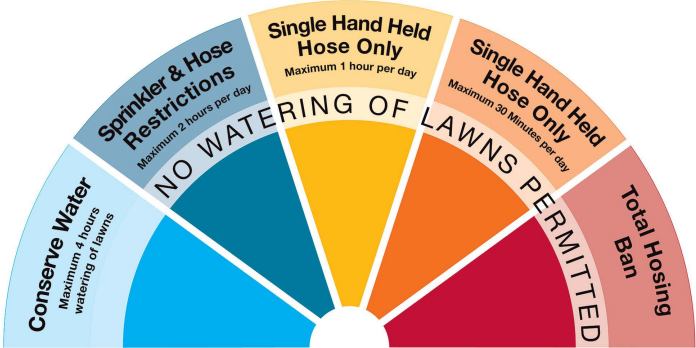
Water Restrictions www.mackenzie.govt.nz