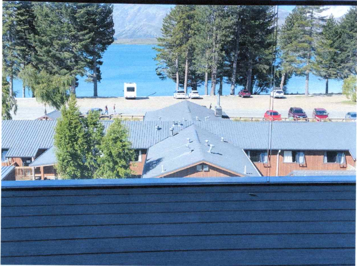
The view from our house lot 11 Station Bay Lake Tekapo