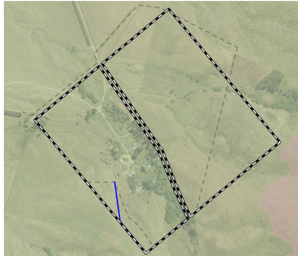
Figure 1 – Proposed Alteration to Southern Boundary of FBA-R14 (shown as blue line)