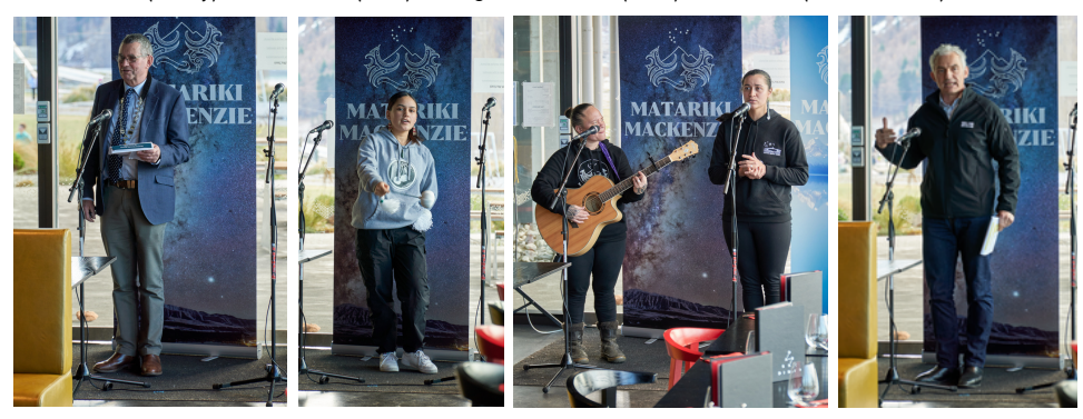
The inaugural Matariki Mackenzie festival took place at Tekapo over 24 and 25 June 2022.

Matariki Mackenzie offers a special place for Mana Whenua, community and manuhiri (visitors) to connect with whānau (family) and whenua (land) through culture, kai (food) and korero (conversation).