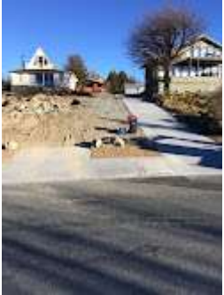
Section 1:5:16.jpeg 126K

Solaray Technology Ltd "powering people's lives"