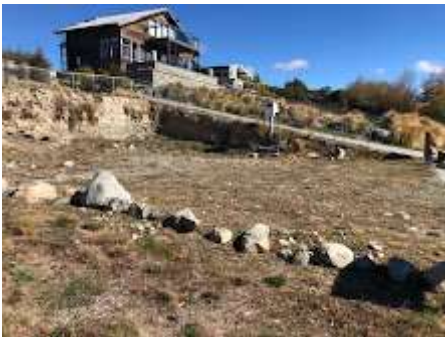
Section 1:7:22.jpeg 159K