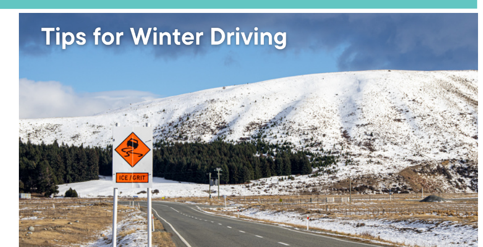
Mackenzie District experiences severe winter driving conditions every winter. Often, these are the worst in the country, and can be life threatening.

Modern cars come with a myriad of safety features, however the most critical is the driver behind the wheel. A number of these safety features lose their effectiveness in snow, ice and driving rain. Note that 4WD vehicles do not exempt you from following these basis rules as when they provide better traction they are still susceptible to black ice, fog, snow and other hazardous winter driving