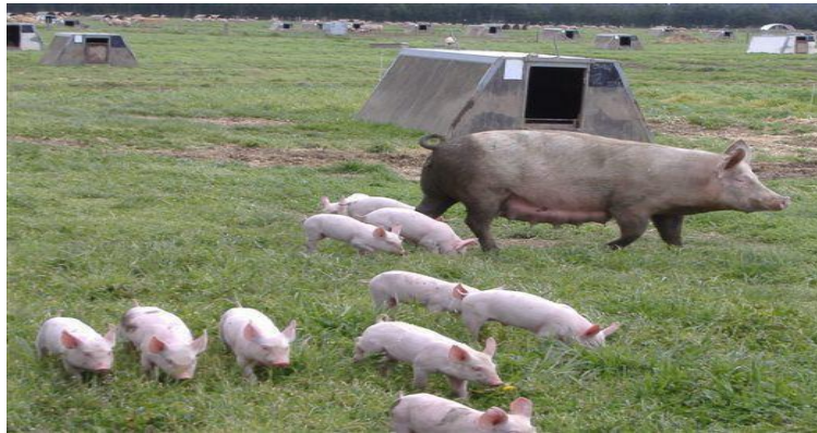
Image 12: Sow and litter in outdoor farrowing paddocks. Movable farrowing huts are visible in the rear of the photo.