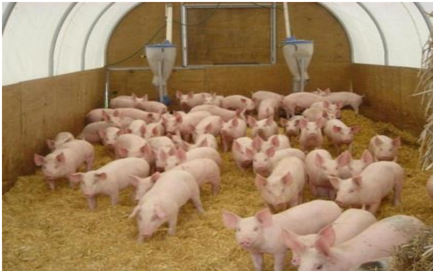
Images 4 and 5: Indoor group housing for newly weaned pigs on straw bedding and growing pigs on a fully slatted floor.