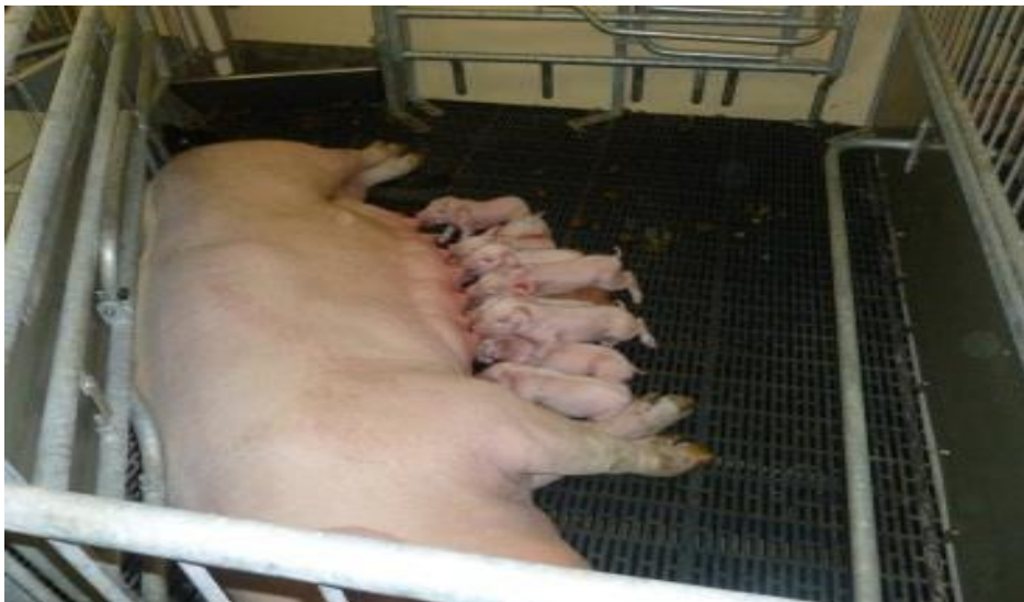
Images 2 and 3 Sows and litters in indoor farrowing facilities