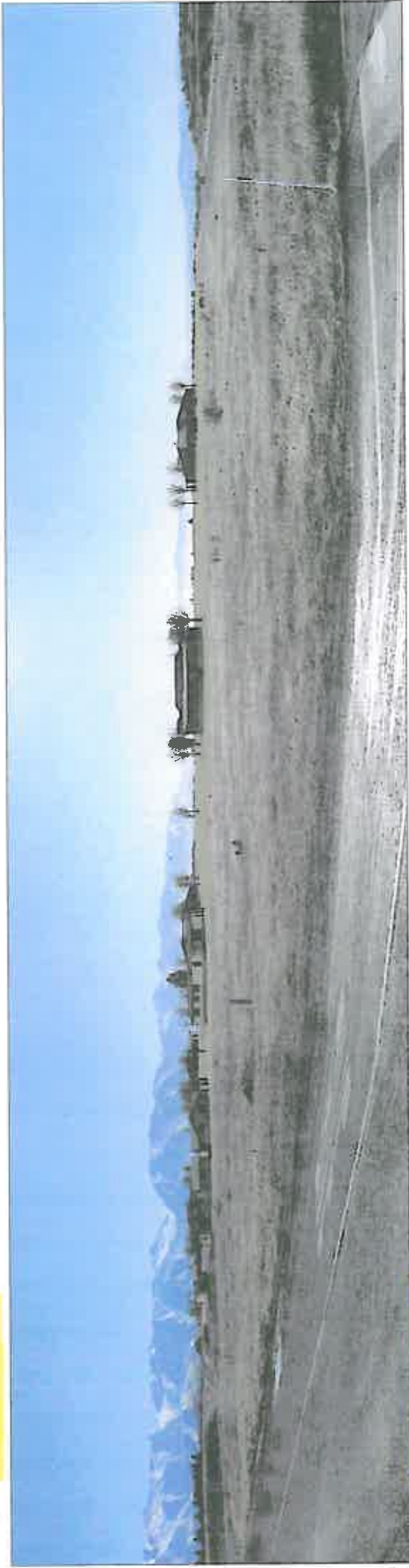
Photograph (B) Looking East from 20th and Main Street View of Mountain View, NV June 2007