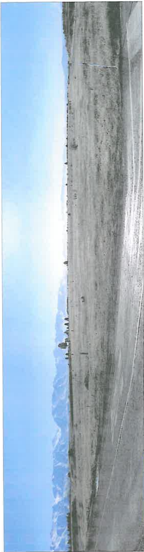
Photograph (A) Looking East from 20th and Main Street View of Mountain View, NV June 2007