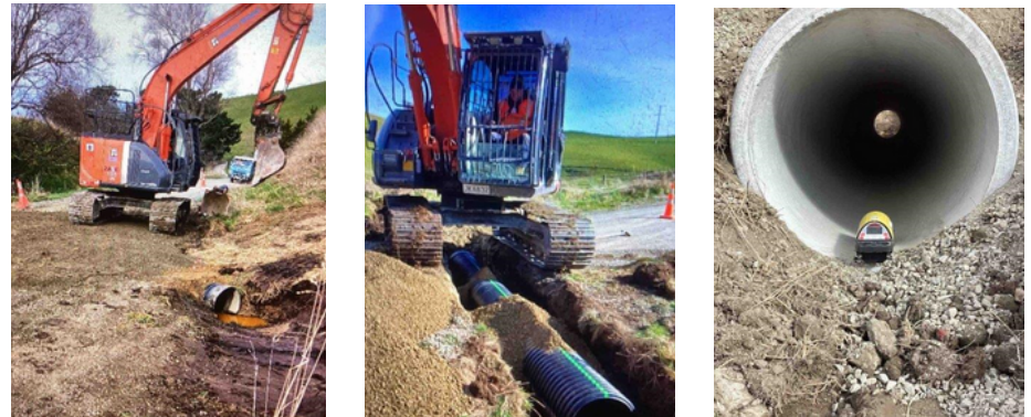
Above - Culvert work on Coal Pit, and Waratah Roads, Albury

Council's roading contractor Fulton Hogan have been busy during the past couple of weeks making the most of the 'settled' weather to recover from the weather event that hit the Canterbury Region in July.