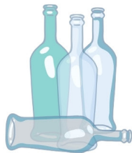
Glass bottles (Rinsed, no lids)