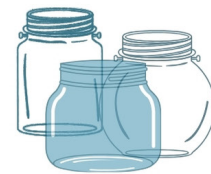
Glass jars (Rinsed, no lids)

The below items are not for the blue glass crate - these go in the red rubbish bin