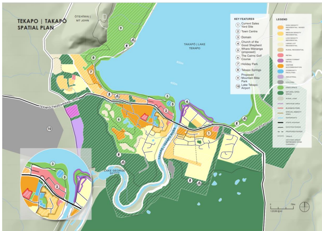
Figure 2: Tekapo Spatial Plan, adopted June 2021.

The Tekapo Spatial Plan adopted by Council in June 2021 is illustrated in Figure 2 below. This identifies the submitters land as High Density Residential/Mixed Use, Medium Density Residential, Visitor Accommodation, and Open Space.