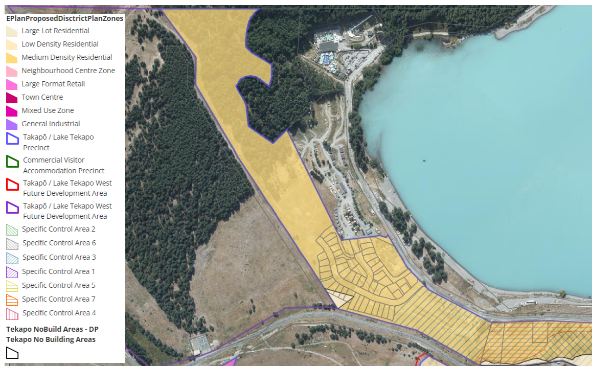
Figure 3: Notified zoning of submitters land in Tekapo, Plan Change 21 – Spatial Plan Implementation.

The notified zoning of the site under PC21 is shown in Figure 3 below.