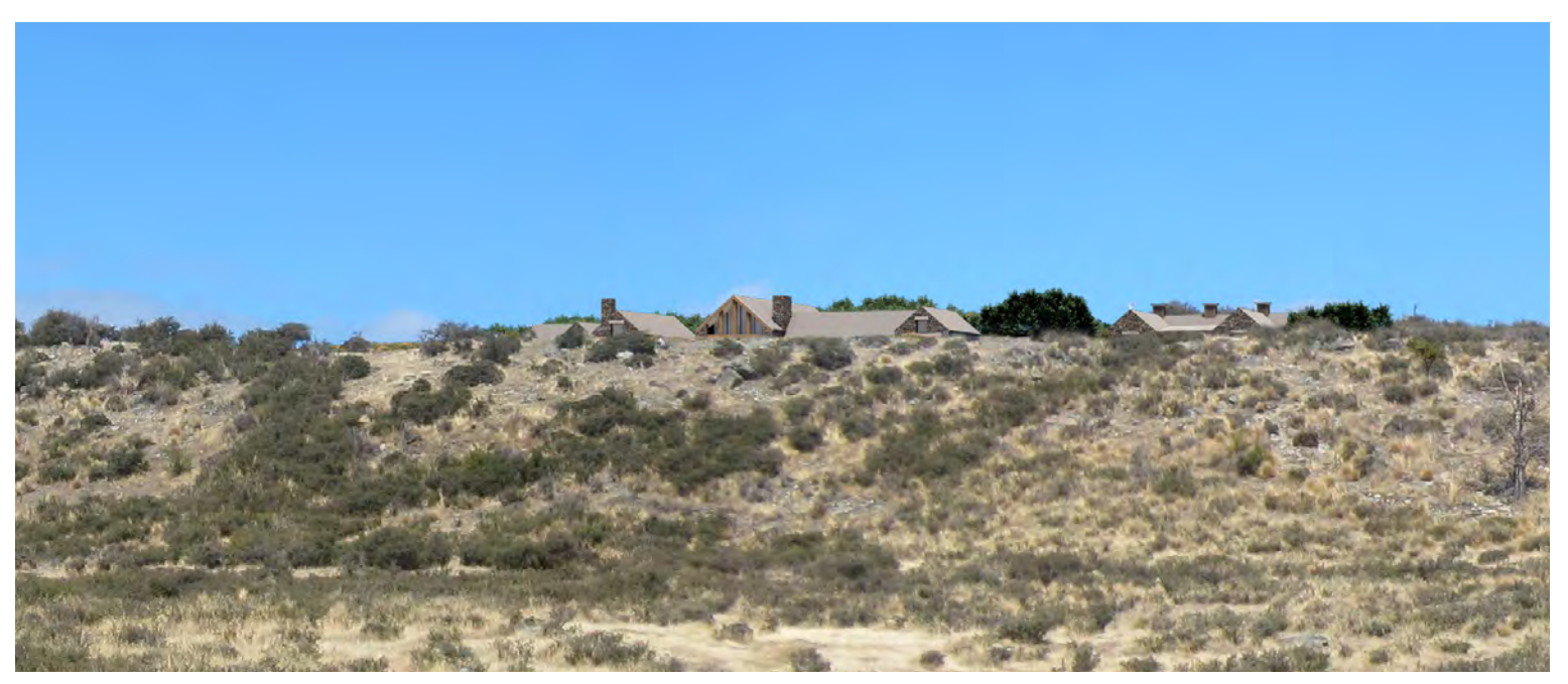
Zoom-in on house