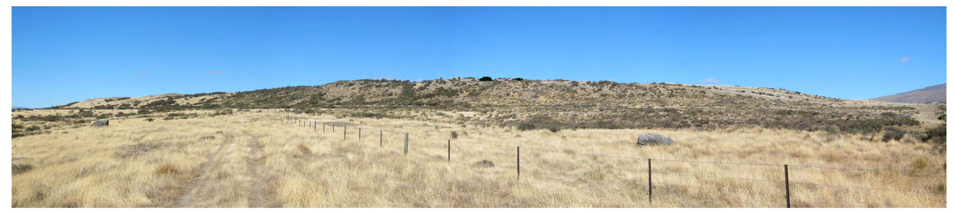
VIEWPOINT H - With house and landscape elements included From lakeside land approximately 360m north of the proposed homestead dwelling, looking south. This is the closest public viewpoint from which the dwelling will be seen.