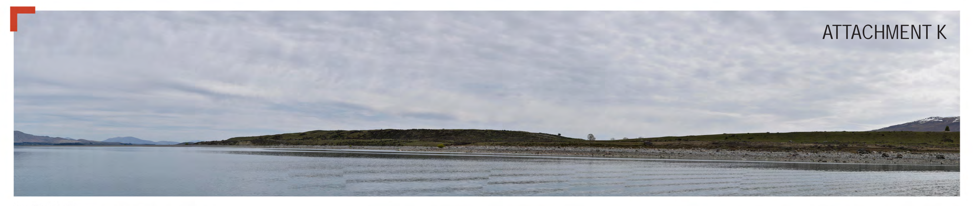
PHOTO 3 - 17 OCT 2024 IMAGE: 124° PANORAMIC, MULTIPLE IMAGE STITCH, 50MM FOCAL LENGTH DISTANCE TO SUBJECT: 1.3KM