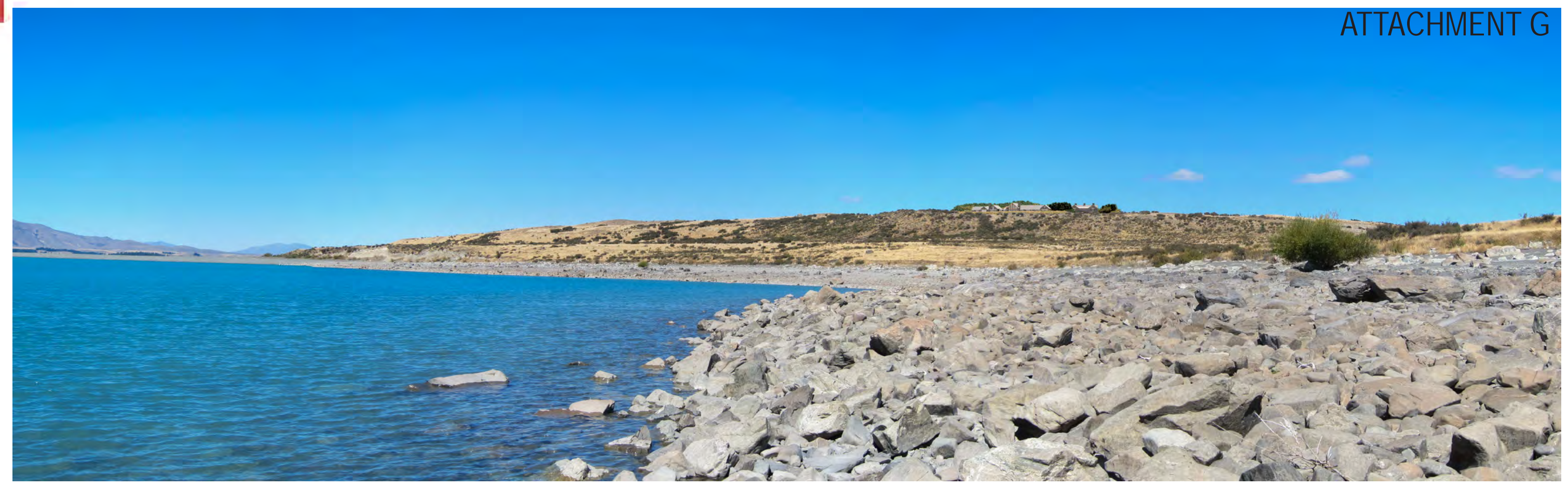
VIEWPOINT I - With house and landscape elements included A similar view to the Viewpoint H view but now 800m from the proposed homestead dwelling.