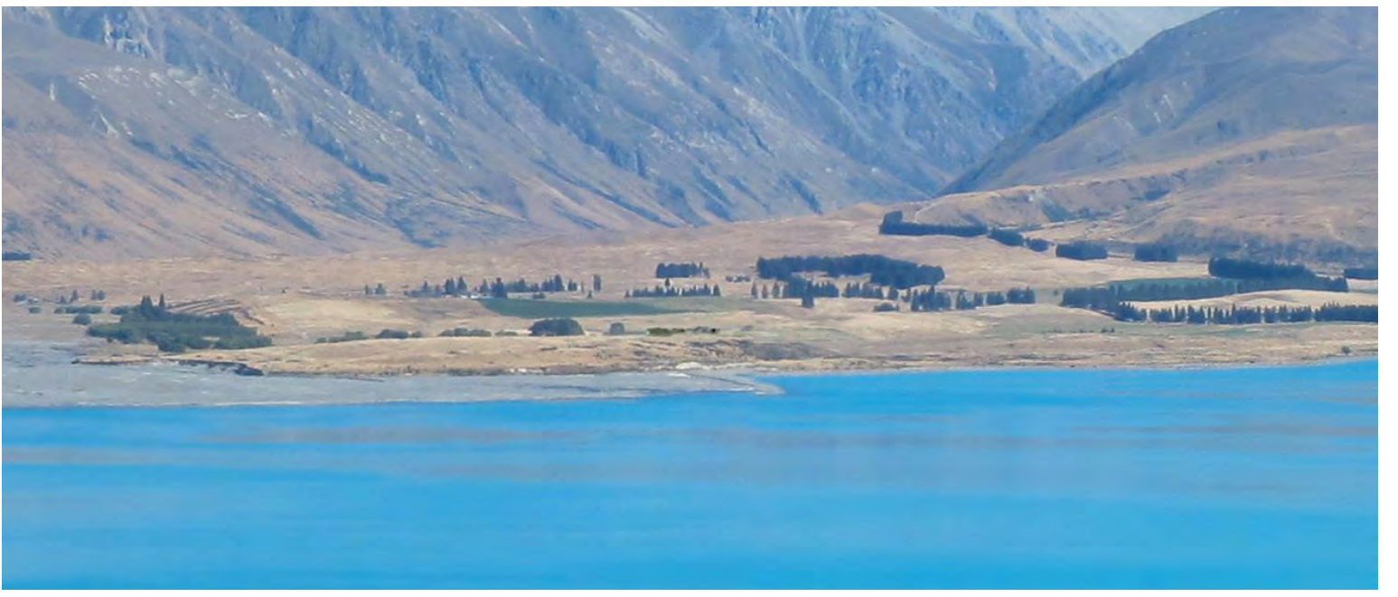
Zoom-in on house