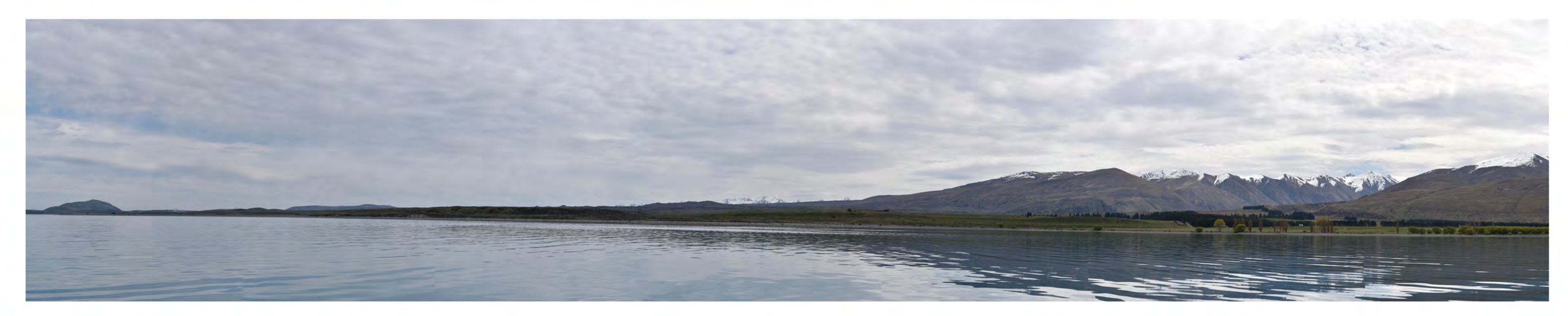
PHOTO 8 - 17 OCT 2024 IMAGE: 124° PANORAMIC, MULTIPLE IMAGE STITCH, 50MM FOCAL LENGTH DISTANCE TO SUBJECT: 2.3KM