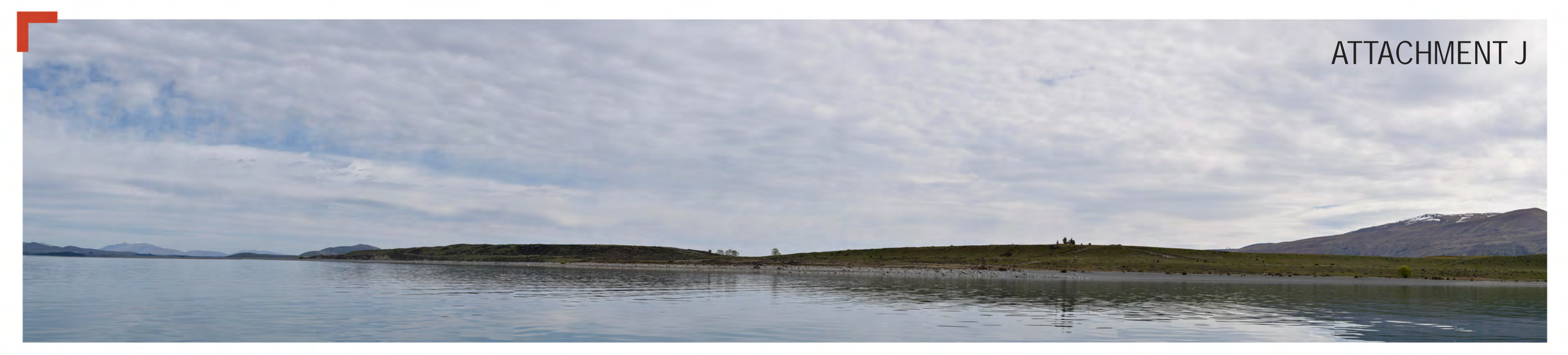
PHOTO 1 - 17 OCT 2024 IMAGE: 124° PANORAMIC, MULTIPLE IMAGE STITCH, 50MM FOCAL LENGTH DISTANCE TO SUBJECT: 1.3KM