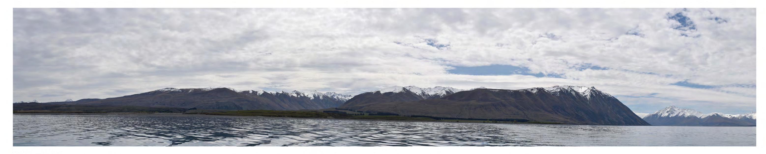
PHOTO 6 - 17 OCT 2024 IMAGE: 124° PANORAMIC, MULTIPLE IMAGE STITCH, 50MM FOCAL LENGTH DISTANCE TO SUBJECT: 2.5KM