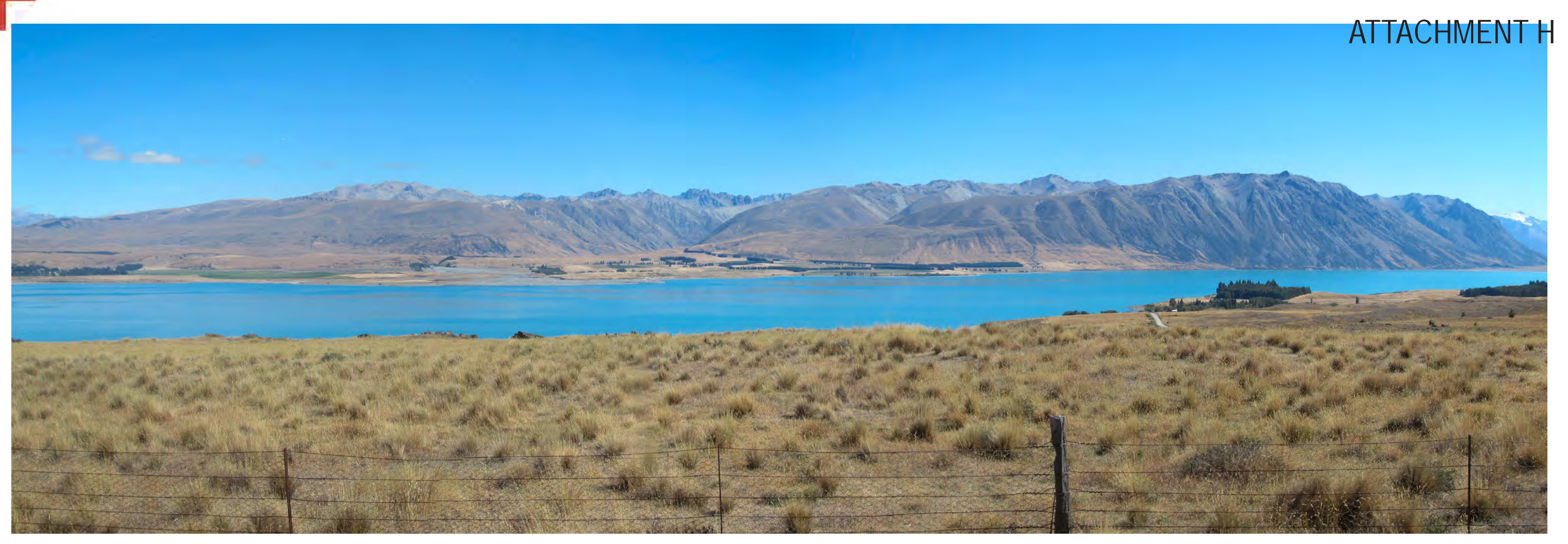
VIEWPOINT G - With house and landscape elements included From a part of the Te Araroa Trail as it descends towards Lake Tekapo, approximately 7km southeast east of the proposed homestead dwelling.