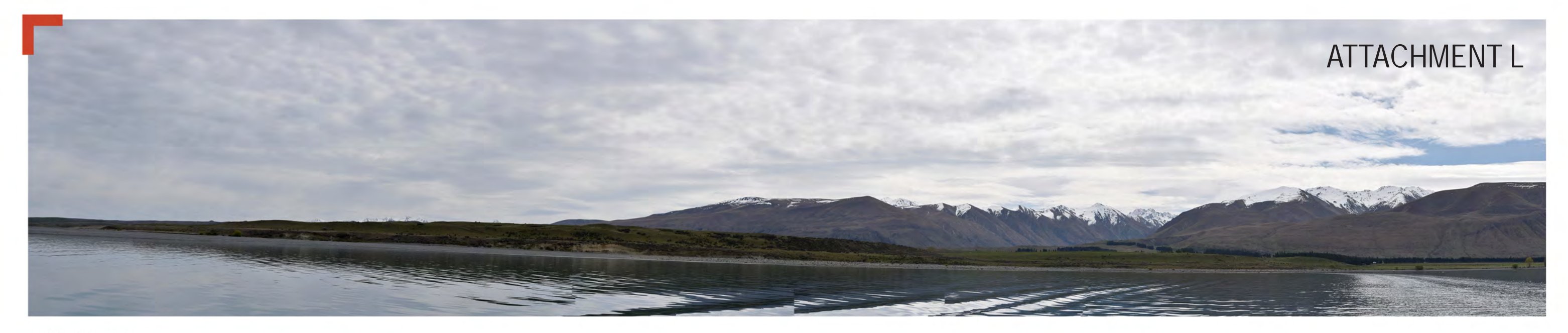
PHOTO 5 - 17 OCT 2024 IMAGE: 124° PANORAMIC, MULTIPLE IMAGE STITCH, 50MM FOCAL LENGTH DISTANCE TO SUBJECT: 2.0KM