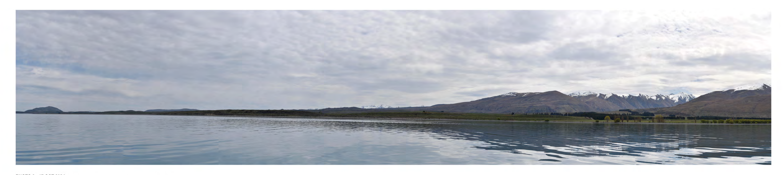
PHOTO 9 - 17 OCT 2024 IMAGE: 124° PANORAMIC, MULTIPLE IMAGE STITCH, 50MM FOCAL LENGTH DISTANCE TO SUBJECT: 1.9KM