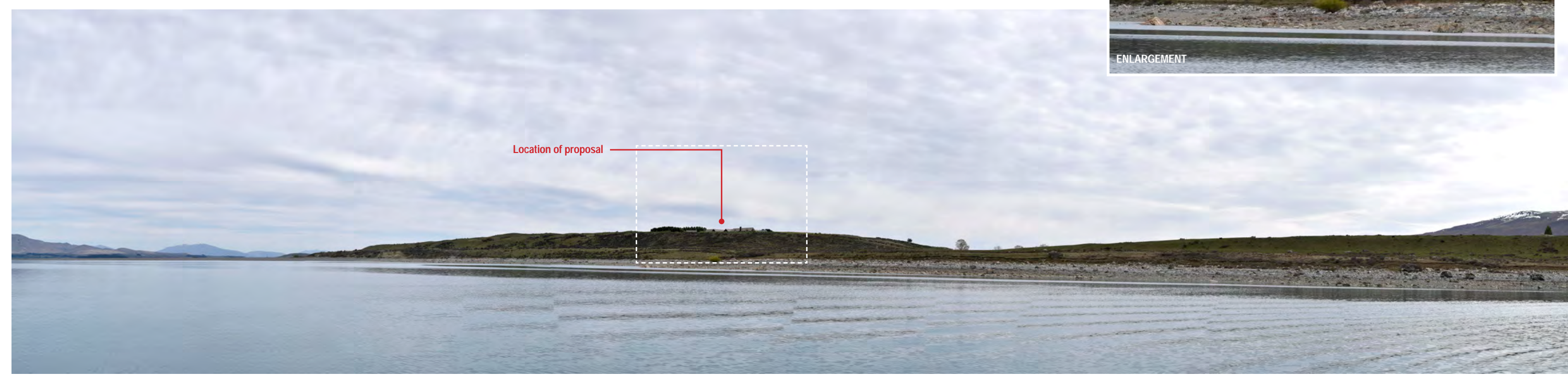
PHOTO 3 - 17 OCT 2024 - WITH DWELLING SUPERIMPOSED IMAGE: 124° PANORAMIC, MULTIPLE IMAGE STITCH, 50MM FOCAL LENGTH DISTANCE TO SUBJECT: 650M