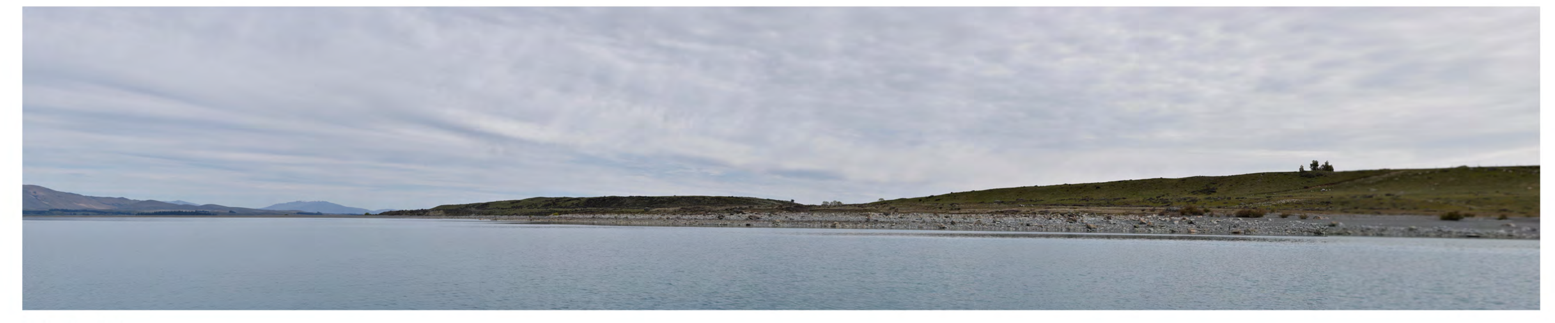
PHOTO 2 - 17 OCT 2024 IMAGE: 124° PANORAMIC, MULTIPLE IMAGE STITCH, 50MM FOCAL LENGTH DISTANCE TO SUBJECT: 810M