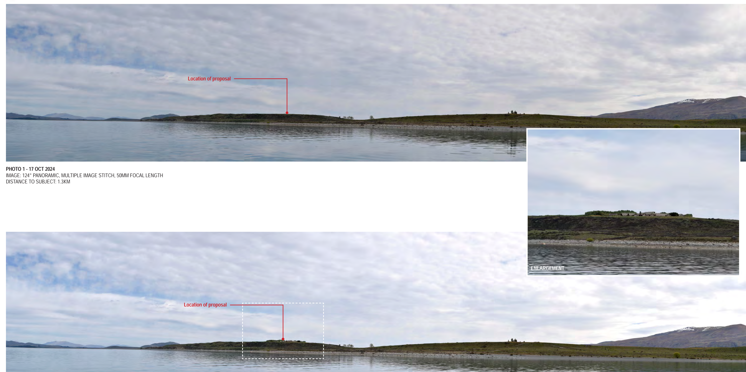
PHOTO 1 - 17 OCT 2024 - WITH DWELLING SUPERIMPOSED IMAGE: 124° PANORAMIC, MULTIPLE IMAGE STITCH, 50MM FOCAL LENGTH DISTANCE TO SUBJECT: 1.3KM