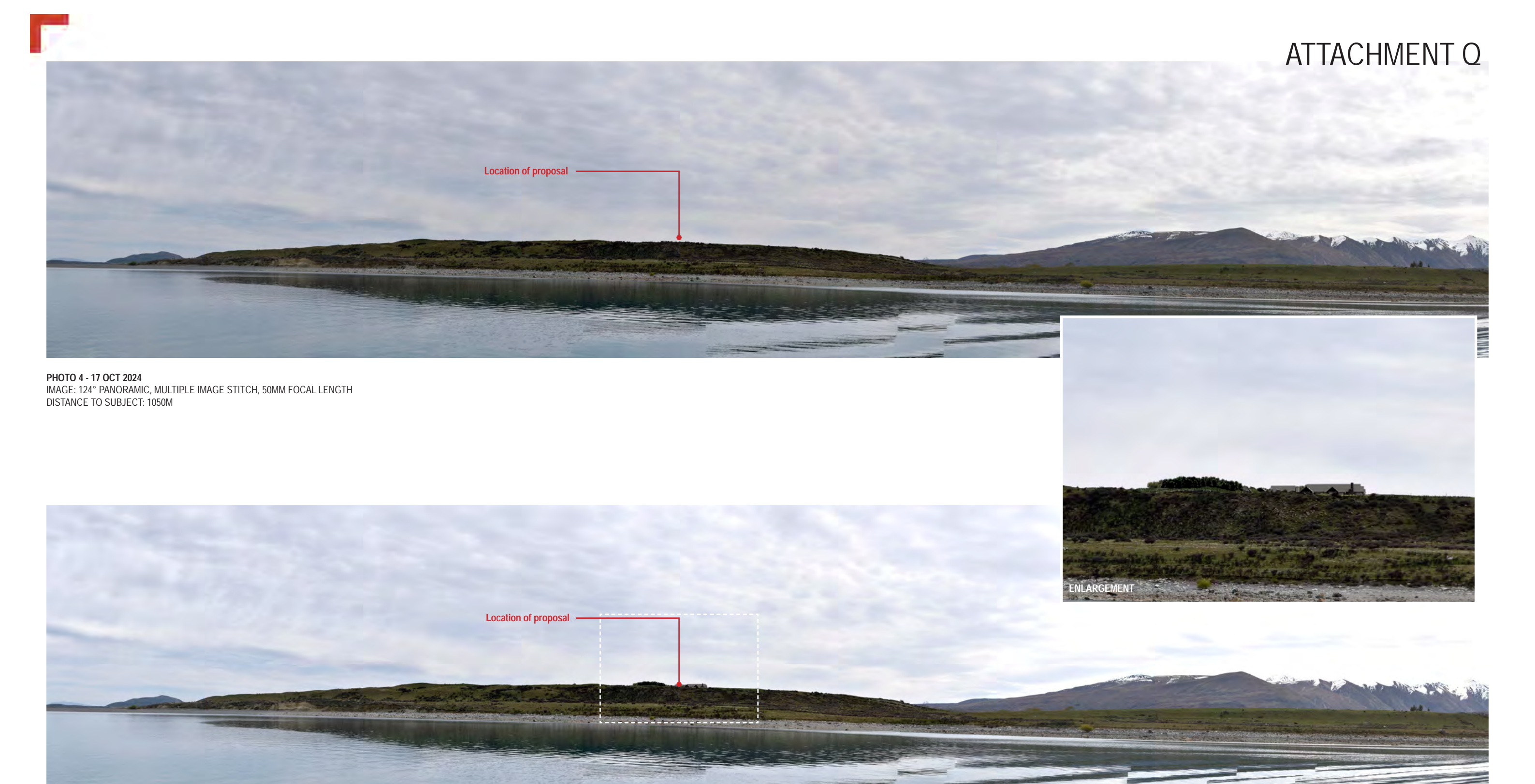
PHOTO 4 - 17 OCT 2024 - WITH DWELLING SUPERIMPOSED IMAGE: 124° PANORAMIC, MULTIPLE IMAGE STITCH, 50MM FOCAL LENGTH DISTANCE TO SUBJECT: 1050M