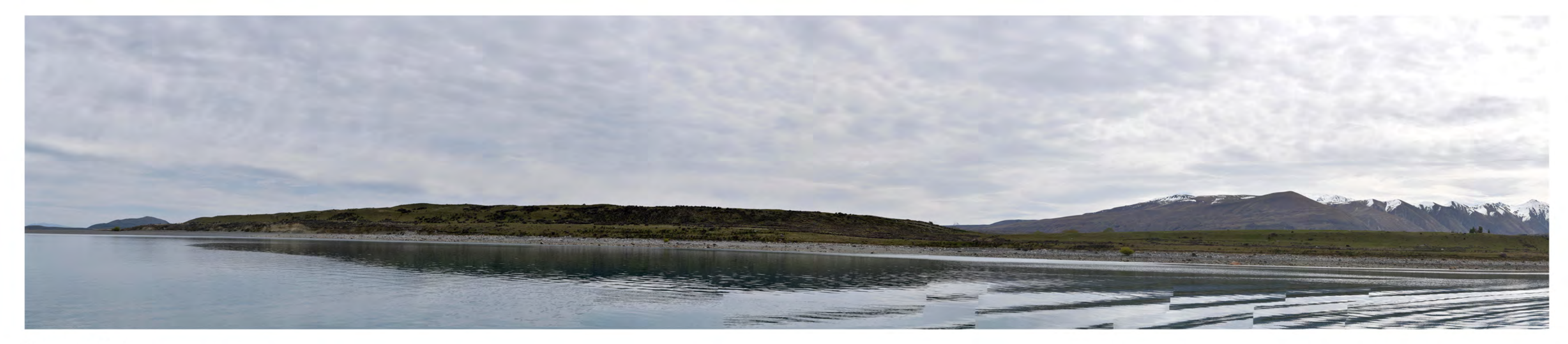
PHOTO 4 - 17 OCT 2024 IMAGE: 124° PANORAMIC, MULTIPLE IMAGE STITCH, 50MM FOCAL LENGTH DISTANCE TO SUBJECT: 810M