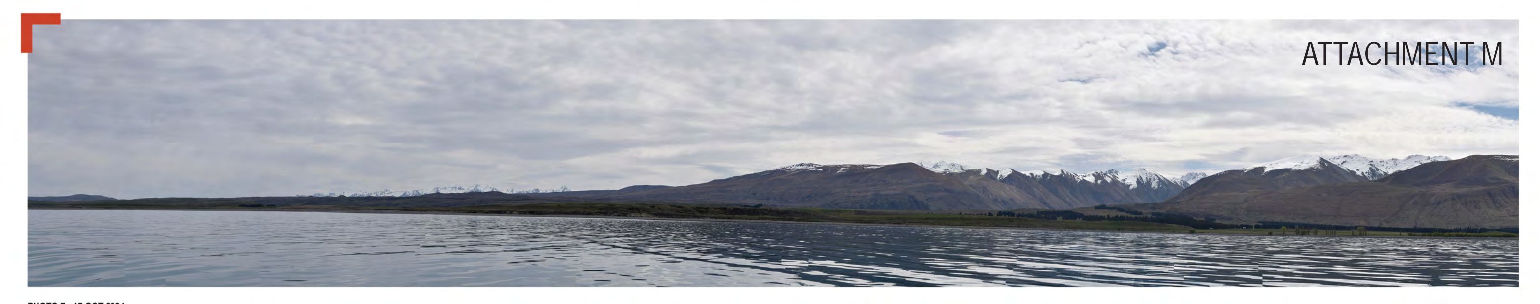
PHOTO 7 - 17 OCT 2024 IMAGE: 124° PANORAMIC, MULTIPLE IMAGE STITCH, 50MM FOCAL LENGTH DISTANCE TO SUBJECT: 1.9KM