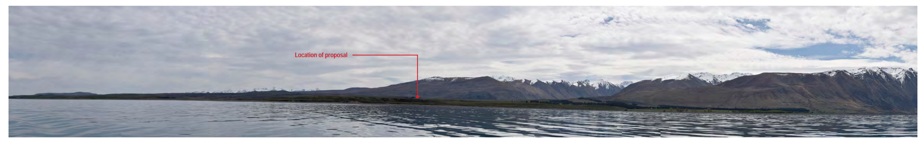
PHOTO 7 - 17 OCT 2024 IMAGE: 124° PANORAMIC, MULTIPLE IMAGE STITCH, 50MM FOCAL LENGTH DISTANCE TO SUBJECT: 1.9KM