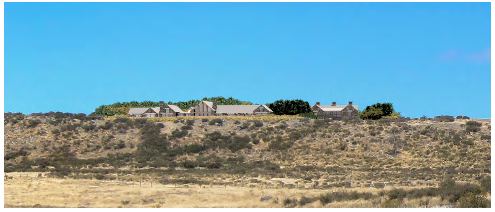
Zoom-in on house