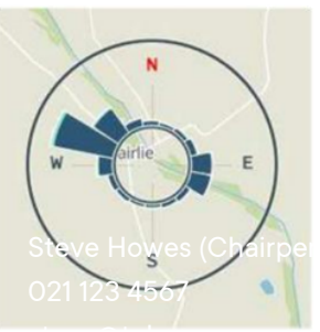
Prevailing Wind - Fairlie

Exeloo Toilets - roof included (2x of 4 pan blocks nico Folieta - Foot iniciluoled (2x of 4 pari blocks) ne cladding (2x blocks = 76sqm) and paving (65sqm) el canopy structure CHS (150-170mm dia) ermospan 150mm roofing (max span 4m for 2kpa) n mesh, fitted over CHS posts (from stone cladding to soffit) ne clad free standing basins 2